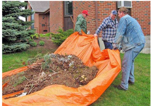
Lots of heavy stuff to move after a long winter. Needs big men to do the hauling!