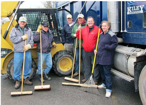
Part of the grounds clean-up crew on the 17 th April. Thanks to our friends at Kiley Paving for trucking away the debris