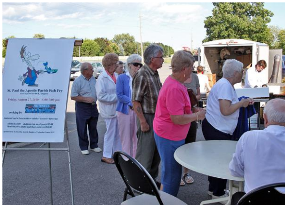
The line-up for the Fish Fry. This is a popular event, and a great fundraiser for the Councils in the area, many of which hold similar events.