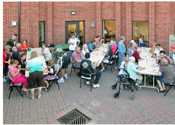
The weather cooperated and the patio was well used throughout the evening.