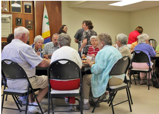
Whether indoors or outdoors, everyone enjoyed the food, as seen here.